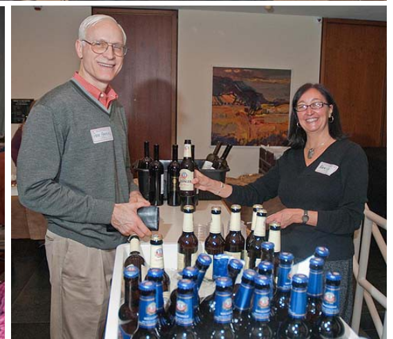
Raclette Evening 2012