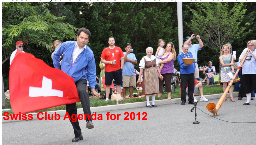
Swiss Club Agenda for 2012