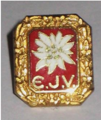
The Edelweiss Pin