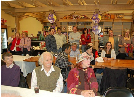
Saujassen and Metzgete

2900 Cathedral Ave NW Washington DC 20008