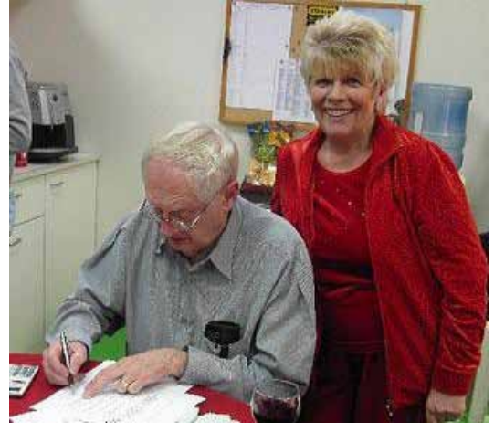
Backus Score Keepers