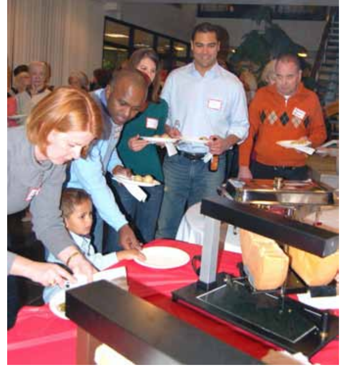
Enjoying an evening of Raclette! POSTILLION appears 4 to 6 x a year; Advertisement: business card $25; 1/4-page $50; 1/2-page $100; full-page $150