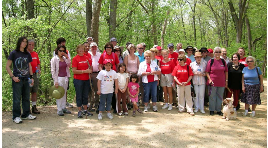
Billy Goat Trail, Photograph courtesy of Adrian Wiestner