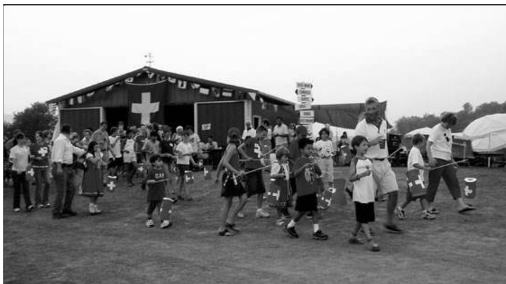
National Day at the Kumkli Farm, VA 2005

Our last event at the Kumkli Farm. Read the article on page 7.