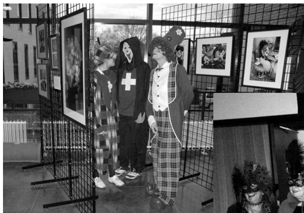
The Basler Fasnacht